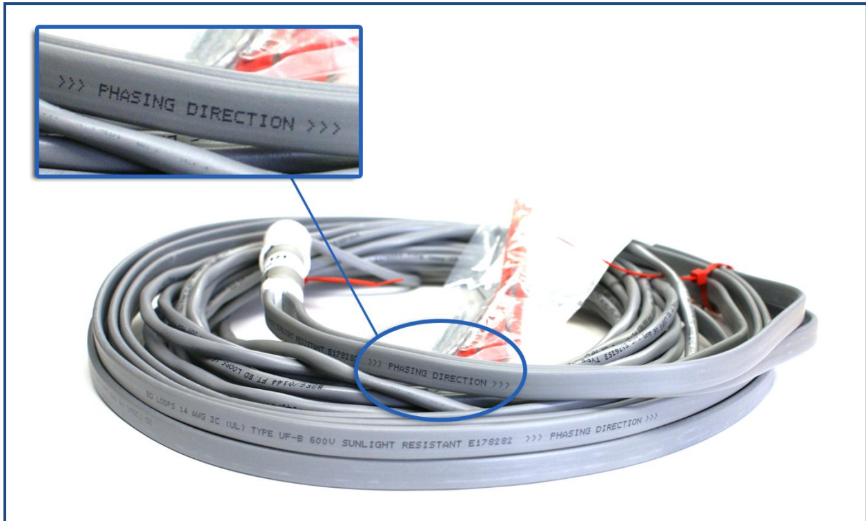
Example of phasing direction printed on a BD Loop - Direct Burial Loop.

If you find that you have installed loops with the current flowing in opposite directions and the gate or door is being detected don't panic! The solution is simple, unhook the loops from the detector and hook up the lead-ins differently to swap the polarity of the loops.