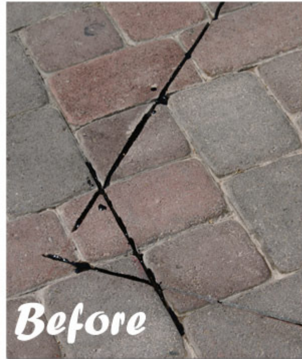
Pavers with Black Sealant

driveway appearance is important to the customer. Most installers (understandably) focus on getting the system working properly and over look the cosmetic appearance of their work. Since loop sealant is not readily available in a wide assortment of colors you will never be able to easily match sealant to the surface of colored stamped concrete or other decorative surfaces.