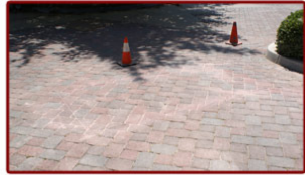
Saw-Cut Tattoo Concealed with Sand

Quite an improvement! We hope you find this trick helpful. Please feel free to share your experiences / photos of job sites using the sand trick.