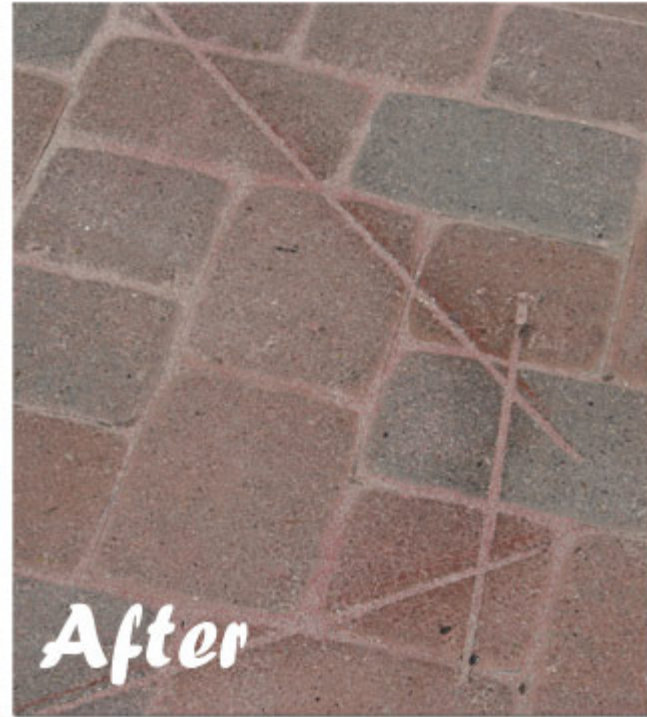
Pavers with Black Sealant and Colored Sand

Many customers, especially home owners care a great deal about how their driveway looks after the work is done and would not be thrilled at the idea of using black, gray, or white loop sealant in their decorative driveway. Installers who are sensitive to the desires of their customers can go above and beyond by using this sand technique. This trick will make your work stand out, and will help your customer feel satisfied with the look of their driveway. Customers will appreciate the care you've taken to improve the appearance of the cut in loops and will be more likely to refer friends and family to your business.