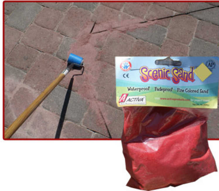
Craft Sand and Paint Roller covered in Artists Tape