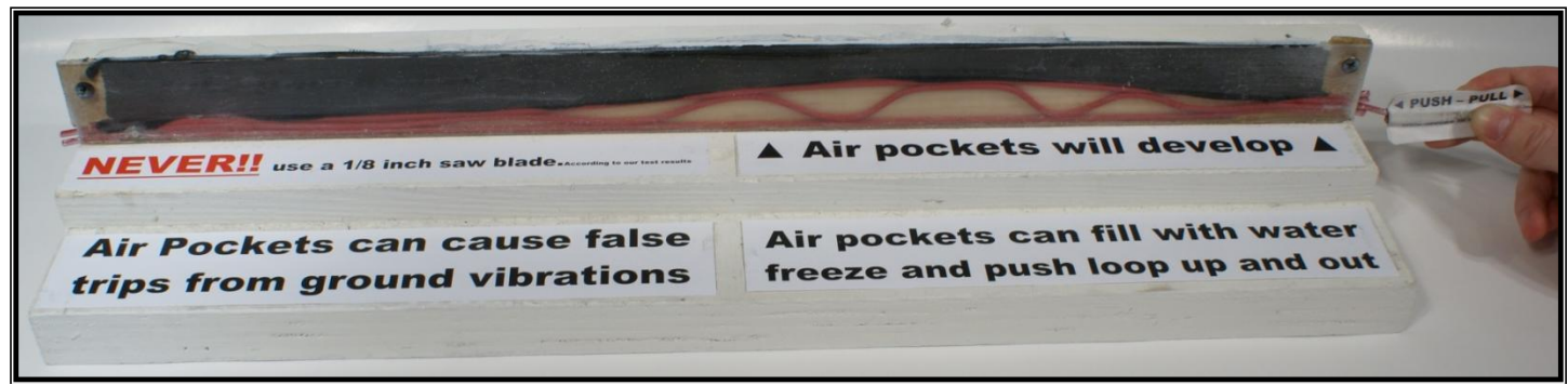
Note the air pockets

These tests are supported by the following pictures, which show clear evidence of the air gaps between the wires.