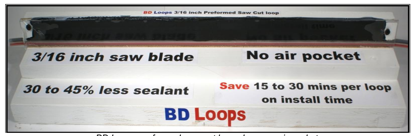
BD Loops preformed saw-cut loops have no air pocket